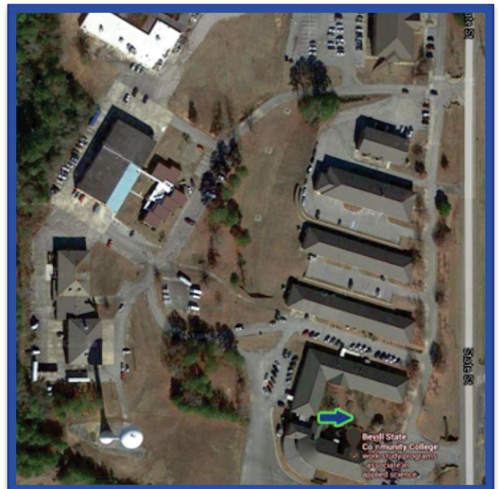
Sumiton Campus Free Speech Area is designated by a blue