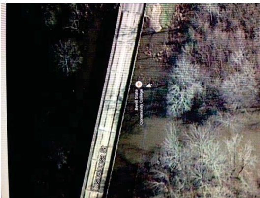
PCEC Free Speech Area is designated by a white arrow.